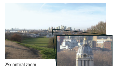
25x optical zoom